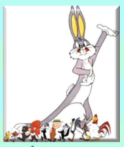
Figure 5 1

Cartoons were so short at first because people would be watching these shorts in the movie theaters before their feature film. When cartoonists could put their shows on TV, they began to get longer, creating the half hour block shows that are on Nickelodeon, Cartoon