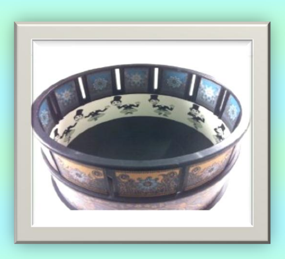
Figure 3 the Zoetrope

Thousand year old cave paintings and burial chambers which have series of animations that show images can also be related to animation" but since there is no possibility of viewing them in motion they do not qualify as animated cartoons. Whether this sort of animation classifies as an early form of animation is highly debated.